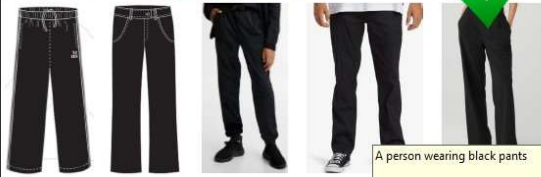
A person wearing black pants Description automatically generated